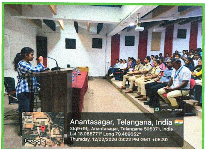
Caption: Safety First, Safety Always – Follow Traffic Rules Road Safety Today, Safe Life Tomorrow